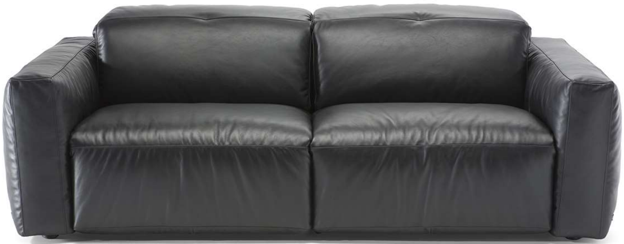
■ Vers. N50+N52