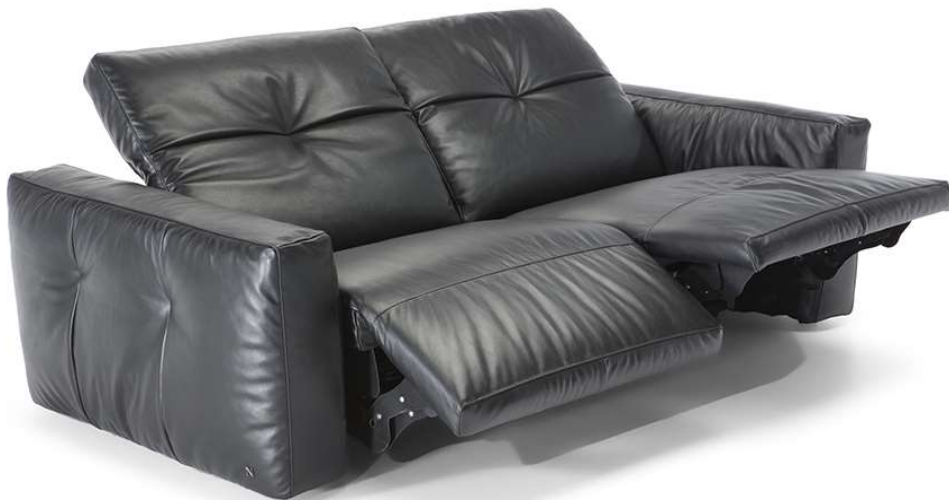
■ Vers. N50+N52