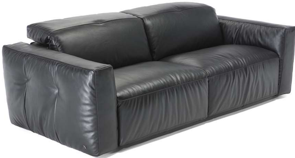
■ Vers. N50+N52